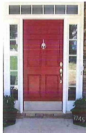
Understanding Energy Ratings for Windows and Doors.

Range: 1 to 100 The lower the number, the more condensation the window or door allows to build up. Energy Star-rated windows tend to resist condensation well.